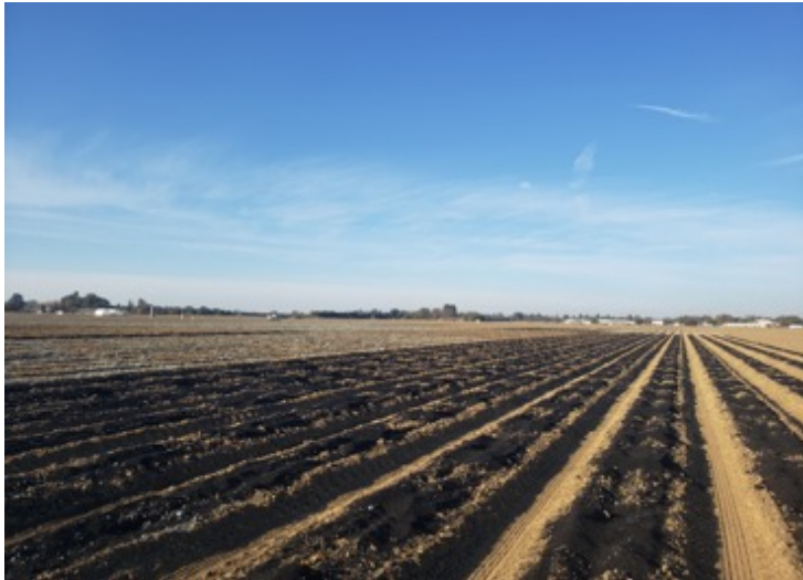
Fields amended with biochar.

This fact sheet is the final installment of a four-part climate-smart agriculture series exploring the relationship between carbon farming, soil health, and soil amendments on CA croplands and rangelands. This fact sheet focuses on biochar amendments and previous fact sheets address the benefits of compost and pulverized rock. The series is intended for members of the technical assistance community who advise CA growers on climate-smart agriculture.